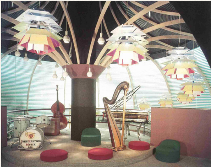
'The House of Tomorrow'