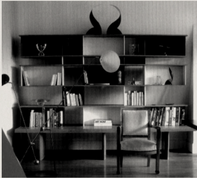
A pair of torcheres above a bookcase in a 1960's Paris interior