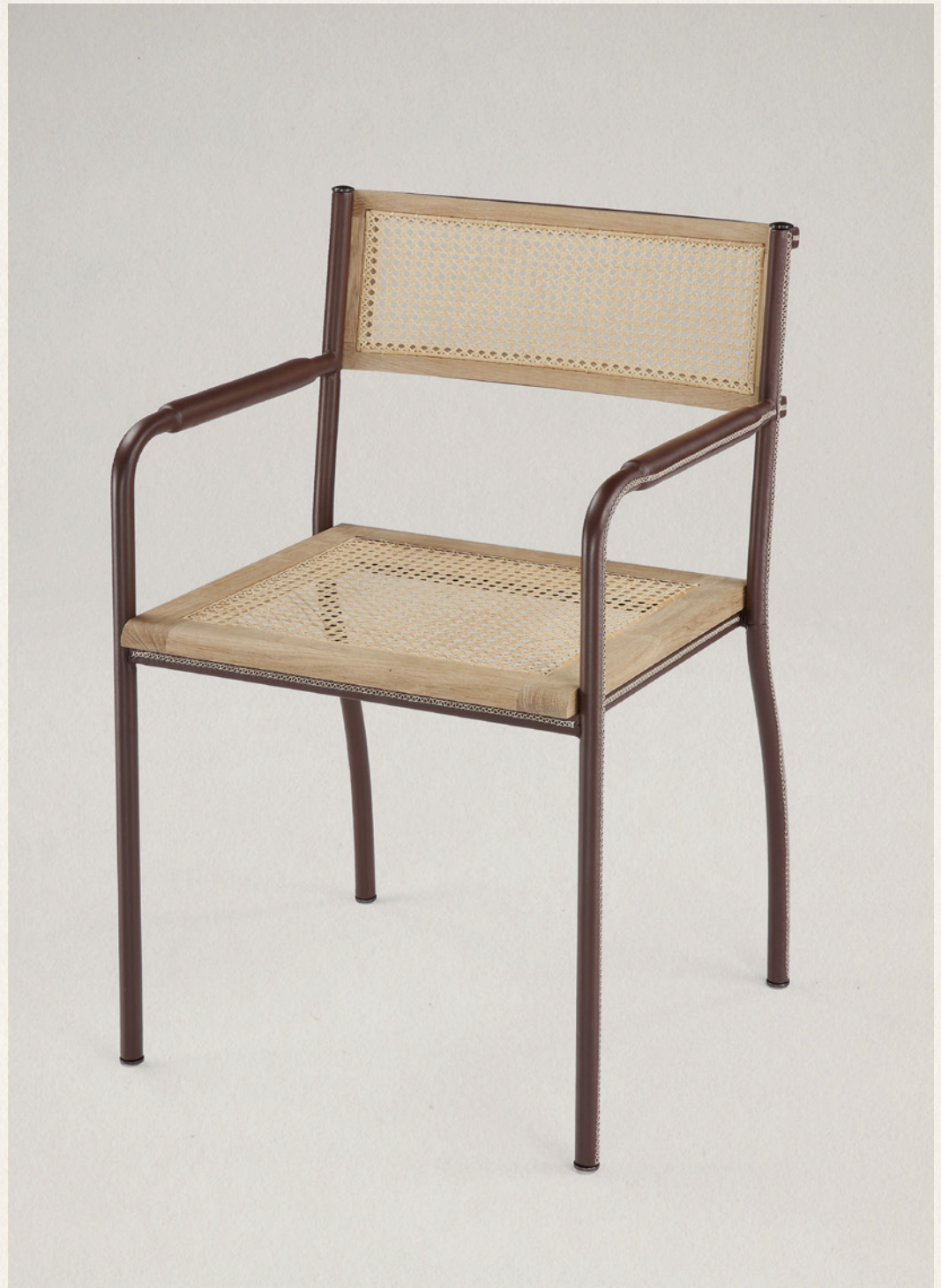
The Stitched Armchair in Brown