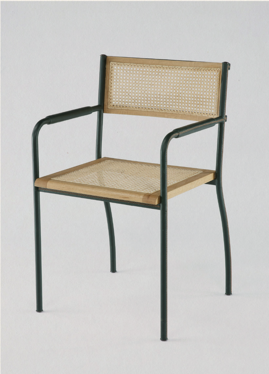
The Stitched Armchair in Green