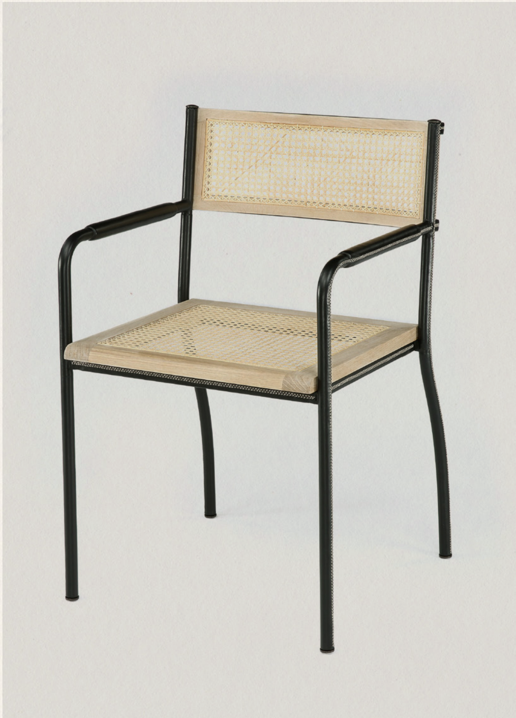
The Stitched Armchair in Black