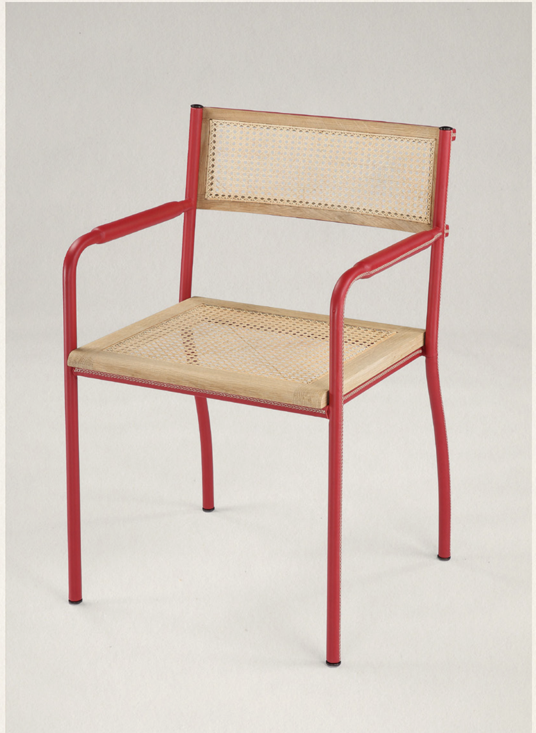
The Stitched Armchair in Red