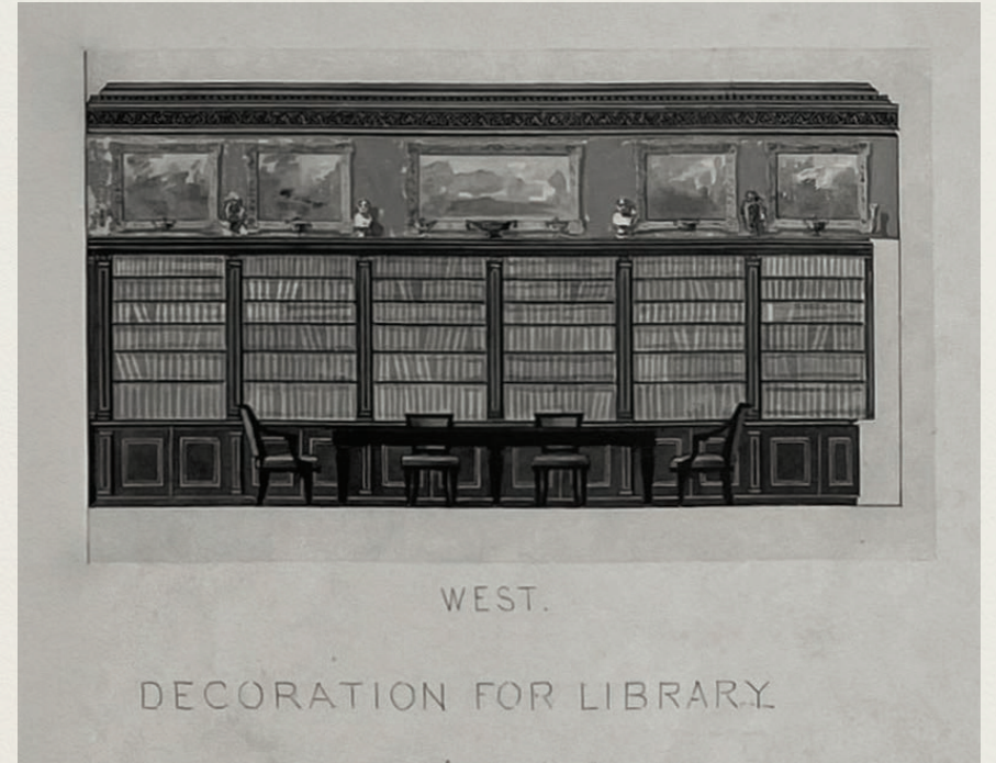
Original watercolour proposal by Owen Jones for the Enysham Hall Library, showing six sections of bookcase.