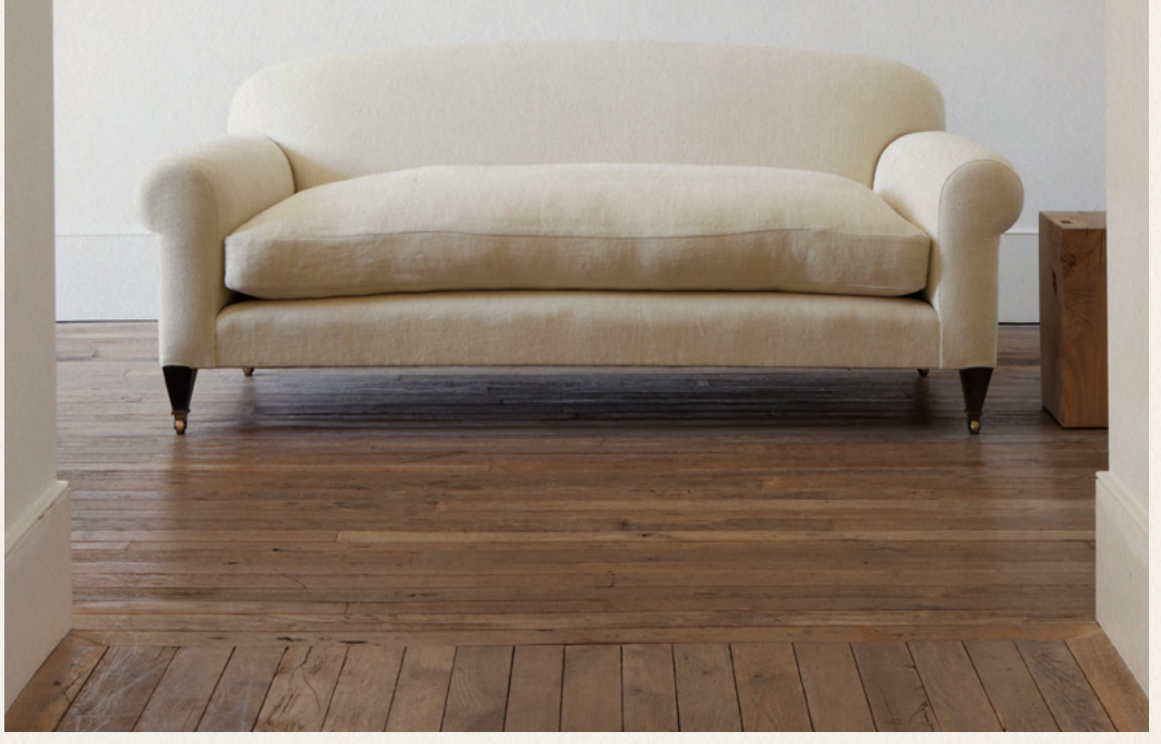
Studio Sofa upholstered in RU Fabric, 'Teacake' Heavy Weight Linen (4537)