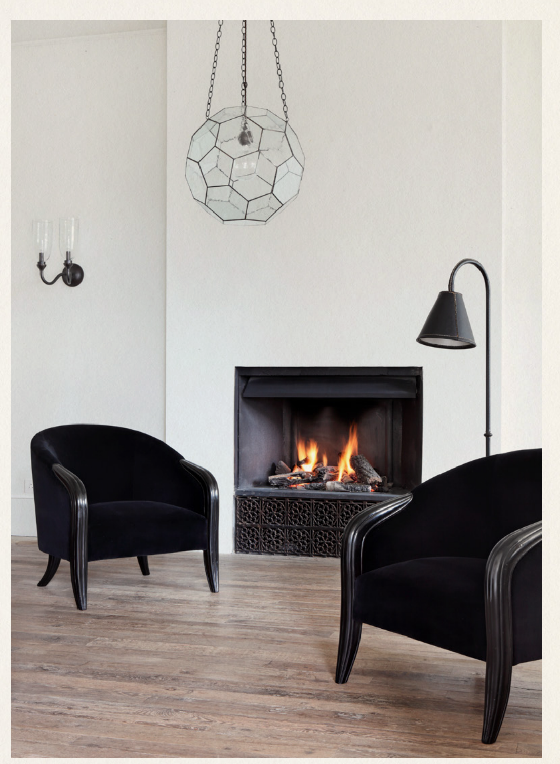
Art Deco "Bombay" Armchairs re-upholstered in RU Fabric, 'Onyx' Cotton Velvet (4201)

Bombay, circa 1940 W77cm × H84cm × D84cm Seat Height: 43cm £15,000