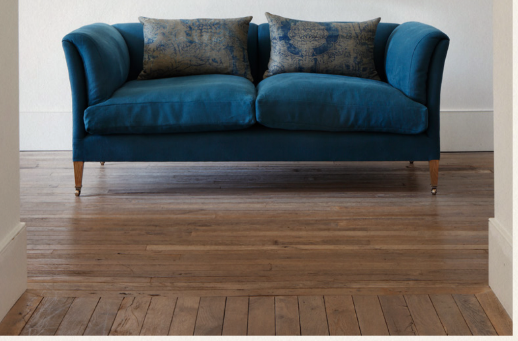
Classic Sofa upholstered in RU Fabric, 'Teal' Heavy Weight Linen (5640)