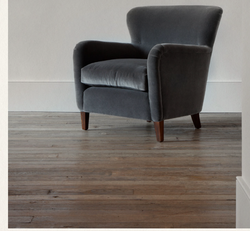
Club Armchair upholstered in RU Fabric, 'Koala' Mohair (6434)