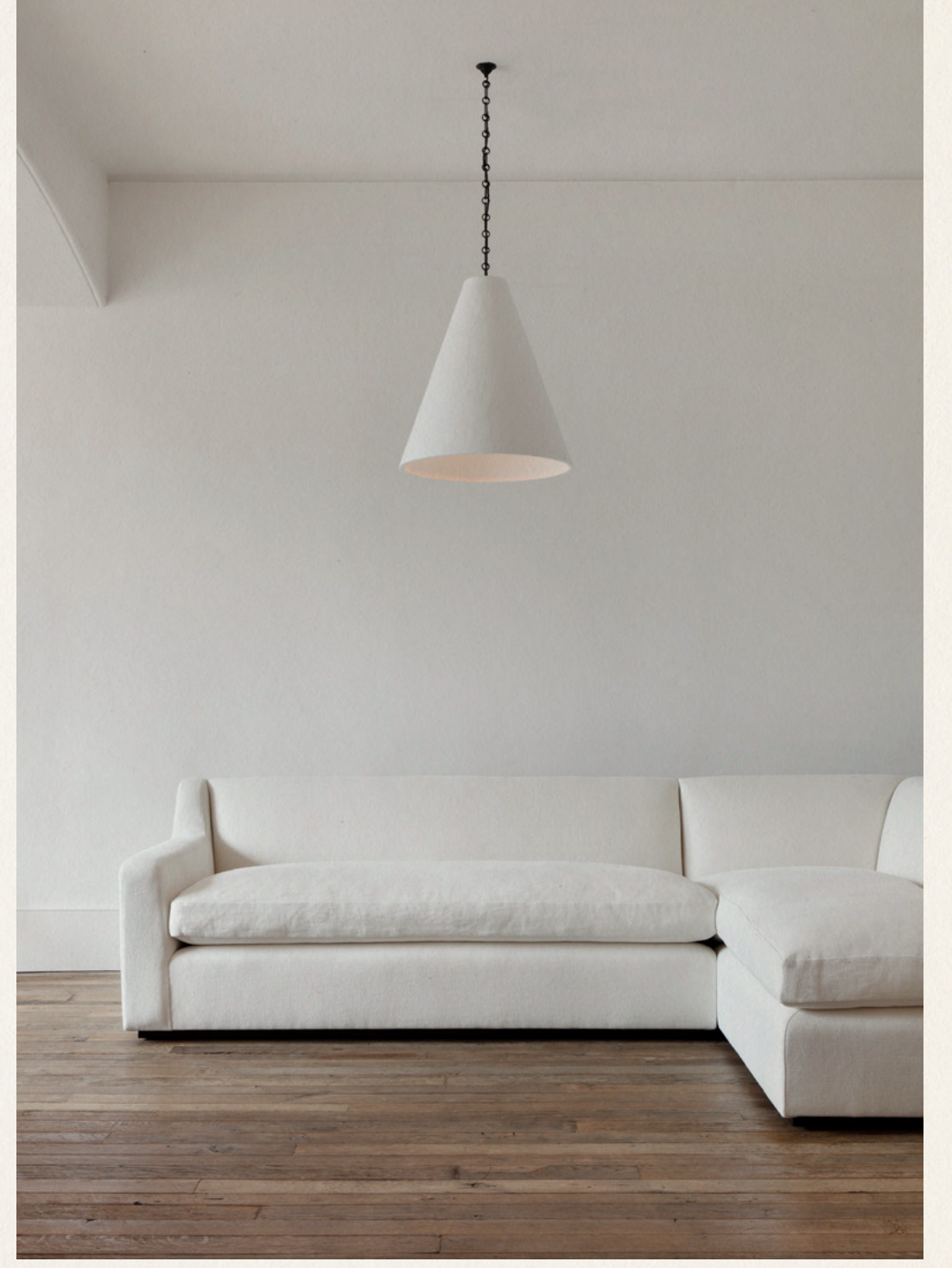
Corner Sofa upholstered in RU Fabric, 'Gull'Heavy Weight Linen (6398) - Option D