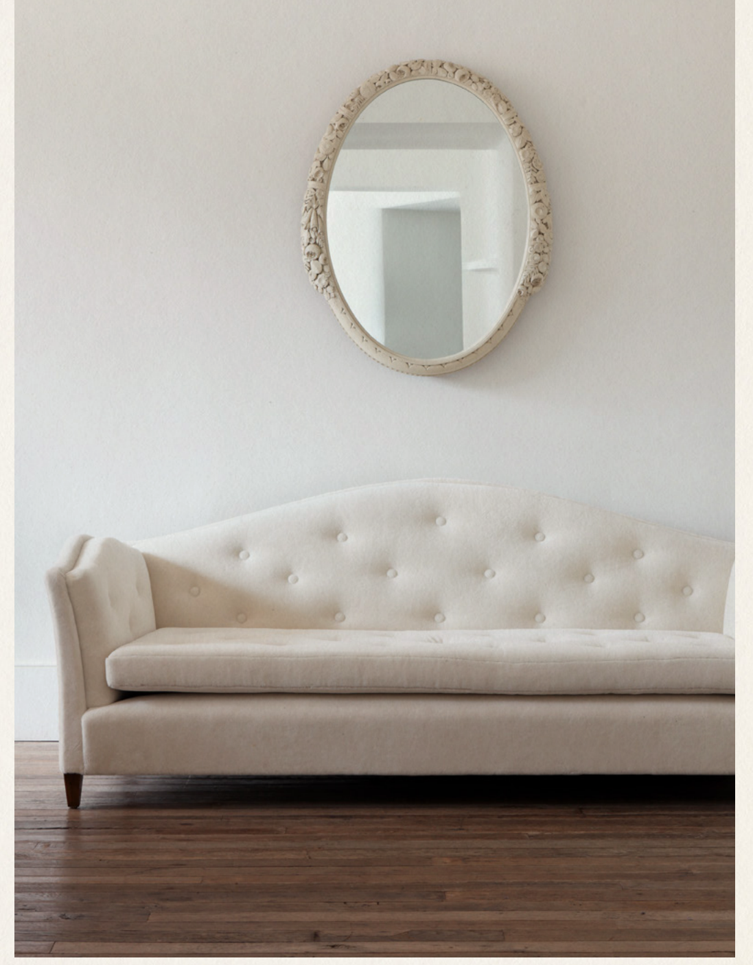
Serpentine Sofa upholstered in RU Fabric, 'Muffle' Alpaca Cotton Velvet (4199)

18m of fabric required W220cm×H86cm×D95cm £9,000