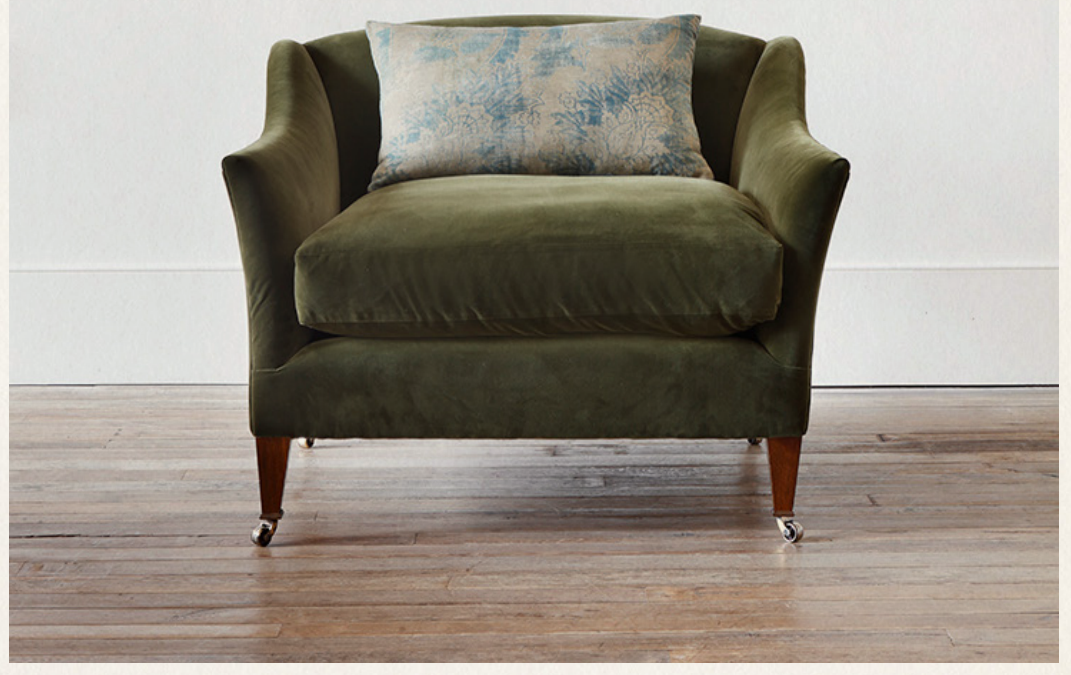
Drawing Room Armchair upholstered in RU Fabric, 'Moss' Cotton Velvet (4195)

8.5m of fabric required W105cm×H80cm×D105cm £4,560