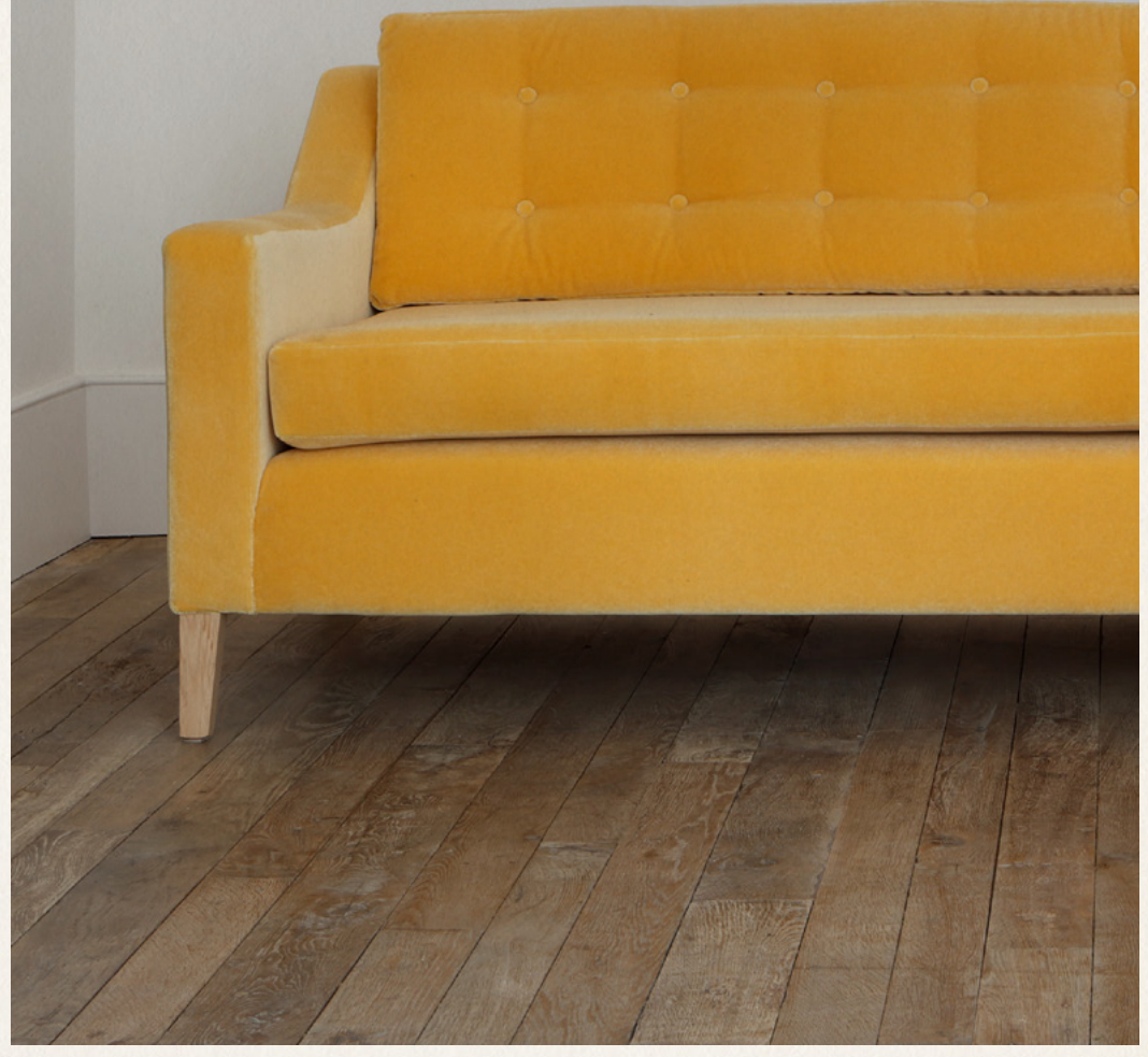
Modernist Sofa upholstered in RU Fabric, 'Eggyolk' Mohair Velvet (6433)