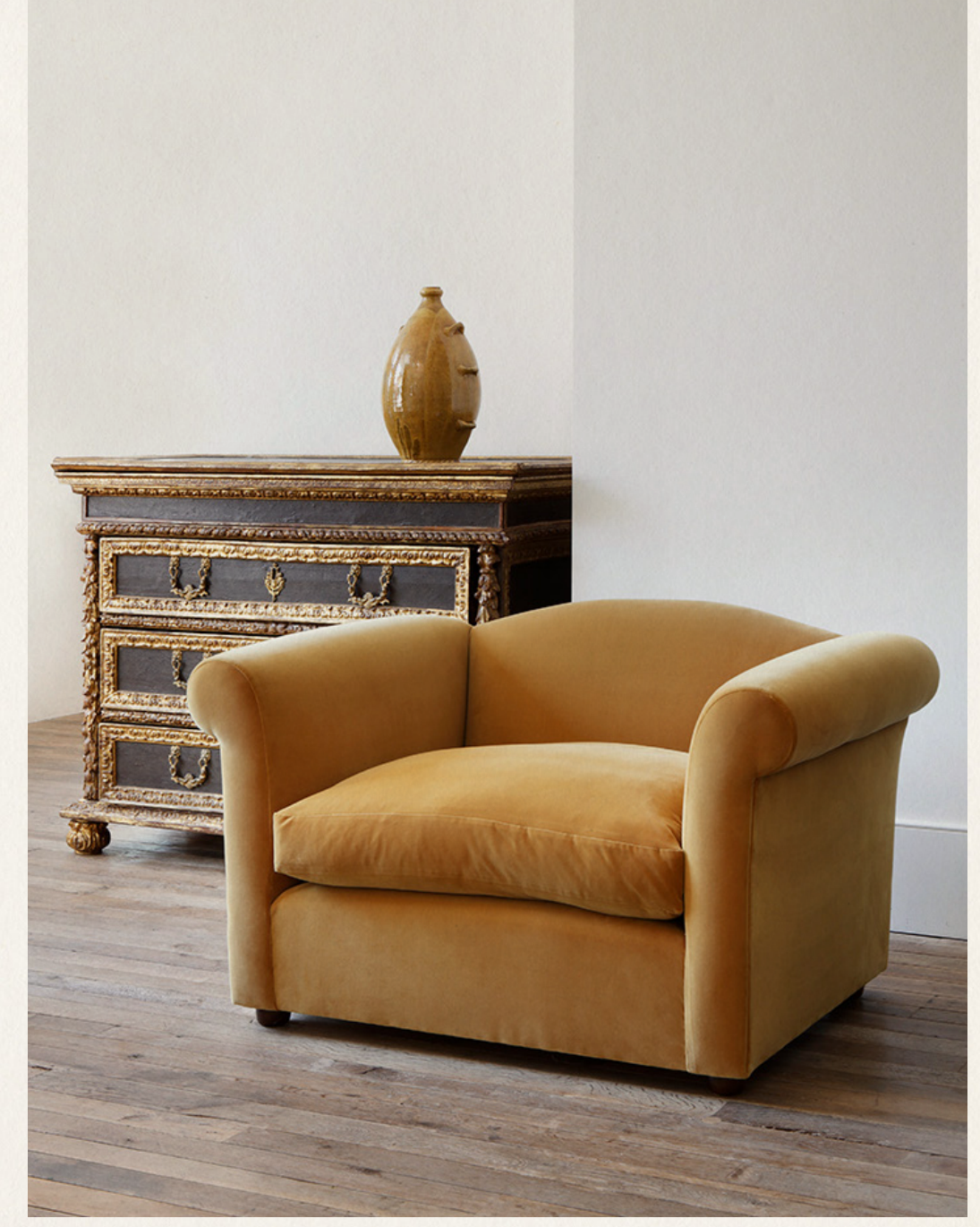
Petersham Armchair upholstered in RU Fabric, 'Java' Cotton Velvet (4192)

11.5m of fabric required W132cm×H77cm×D98cm £4,560