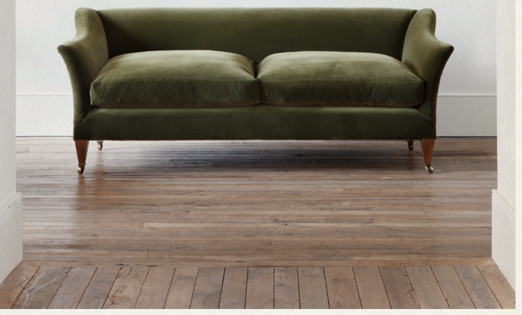
Drawing Room Sofa upholstered in RU Fabric, 'Moss' Cotton Velvet (4195)

X Large 18.5m of fabric required W300cm×H80cm×D110cm £10,320