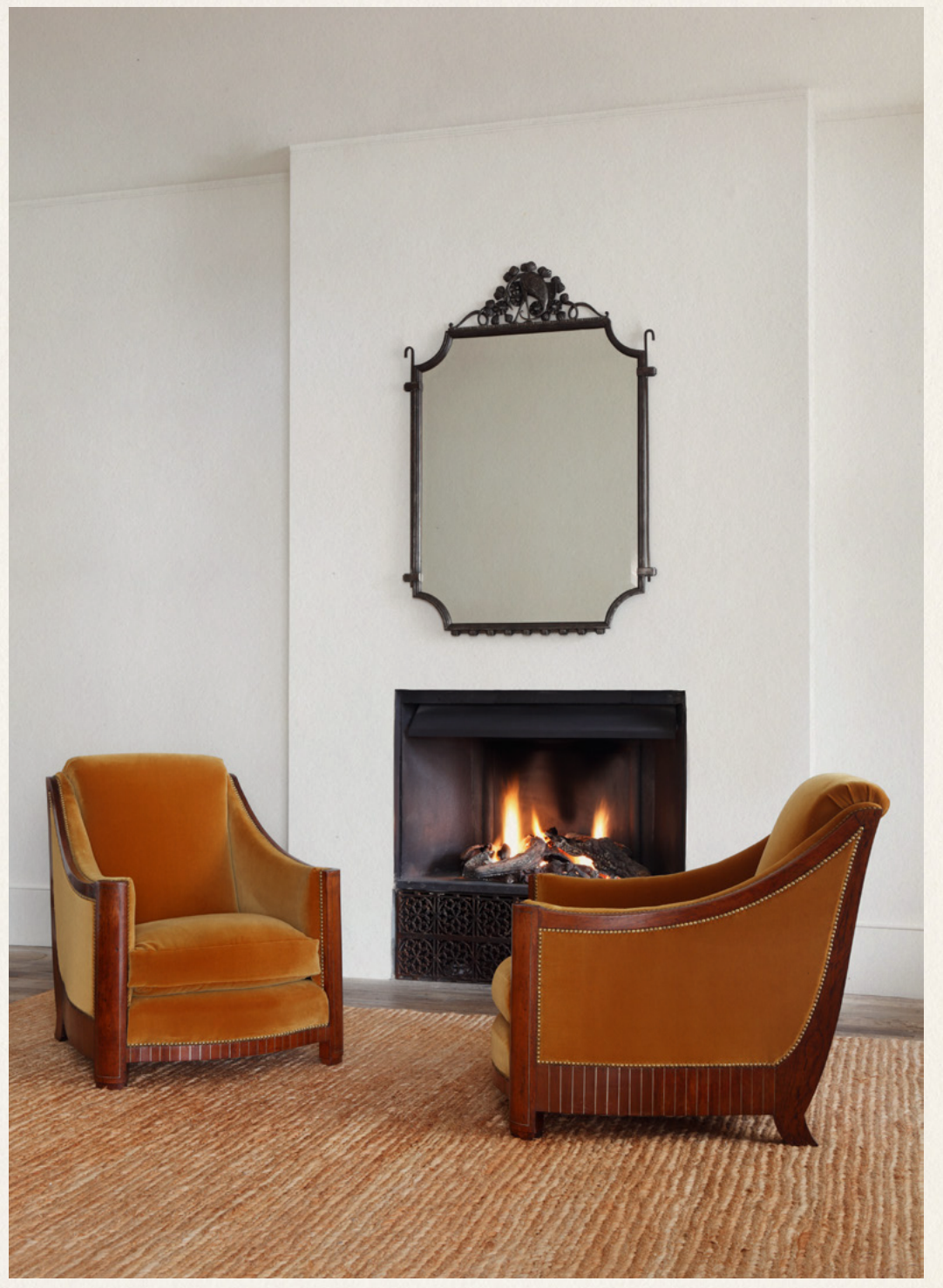
Pair of Armchairs upholstered in RU Fabric, 'Java' Cotton Velvet (4192)

France, circa 1920's W72cm×H88cm×D88cm £25,000