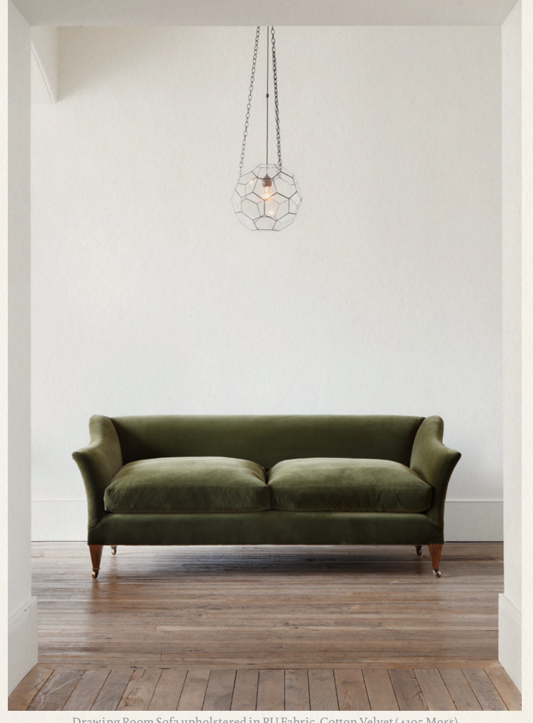
Drawing Room Sofa upholstered in RU Fabric, Cotton Velvet (4195 Moss)

XLarge 20m of fabric required W300cm×H80cm×D110cm £10,200