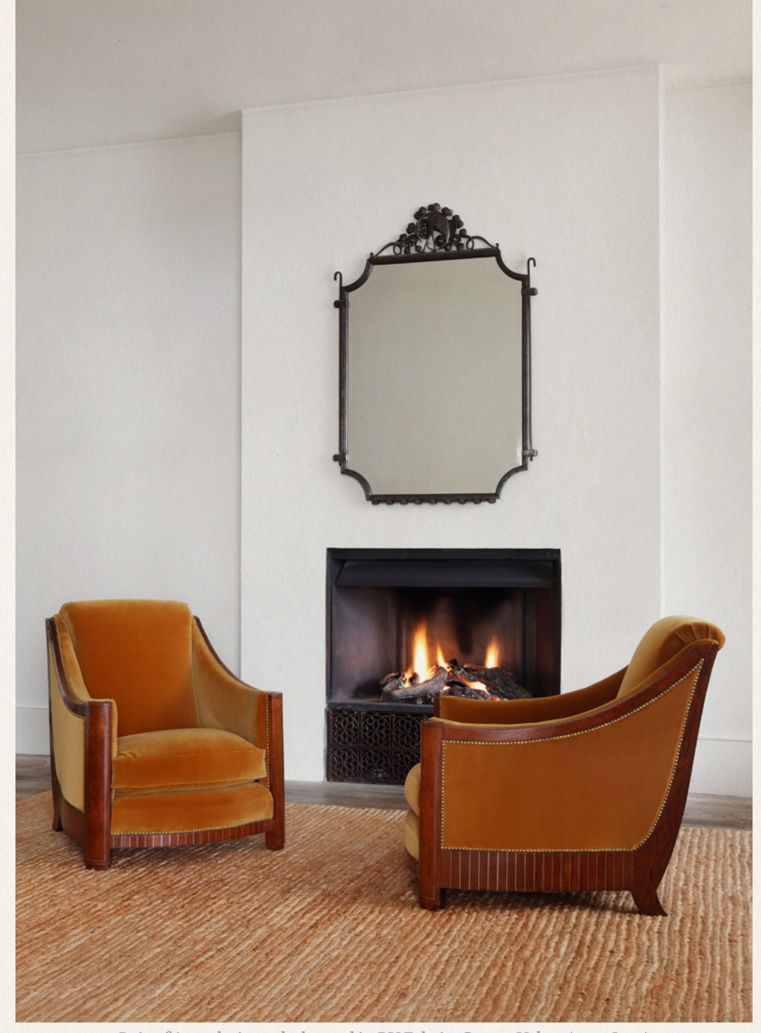
Pair of Armchairs upholstered in RU Fabric, Cotton Velvet (4192 Java)

France, circa 1920's W72cm×H88cm×D88cm £25,000