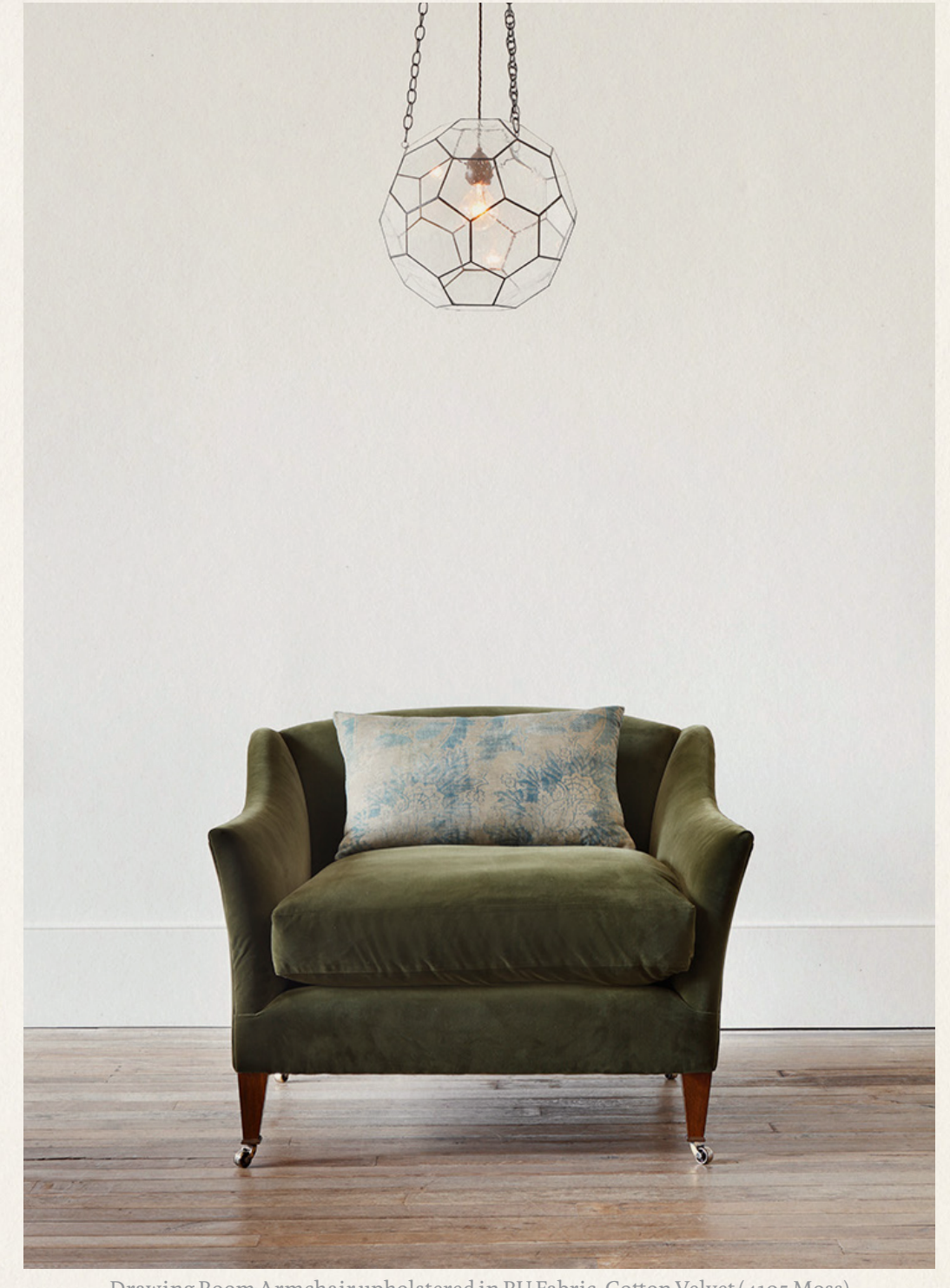
Drawing Room Armchair upholstered in RU Fabric, Cotton Velvet (4195 Moss)

12m of fabric required W105cm×H8ocm×D105cm £4,560