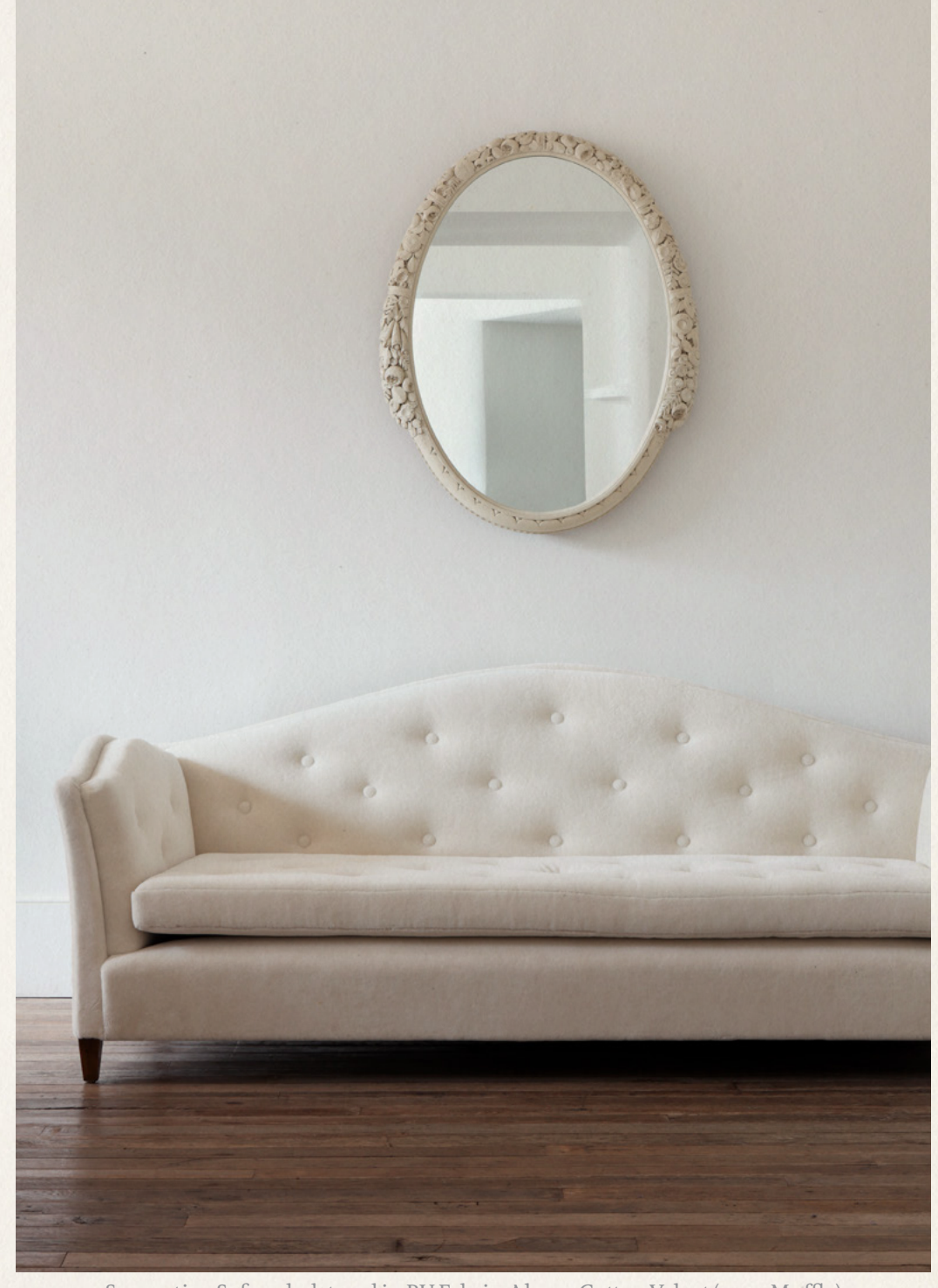
Serpentine Sofa upholstered in RU Fabric, Alpaca Cotton Velvet (4199 Muffle)

18m of fabric required W220cm×H86cm×D95cm £9,000