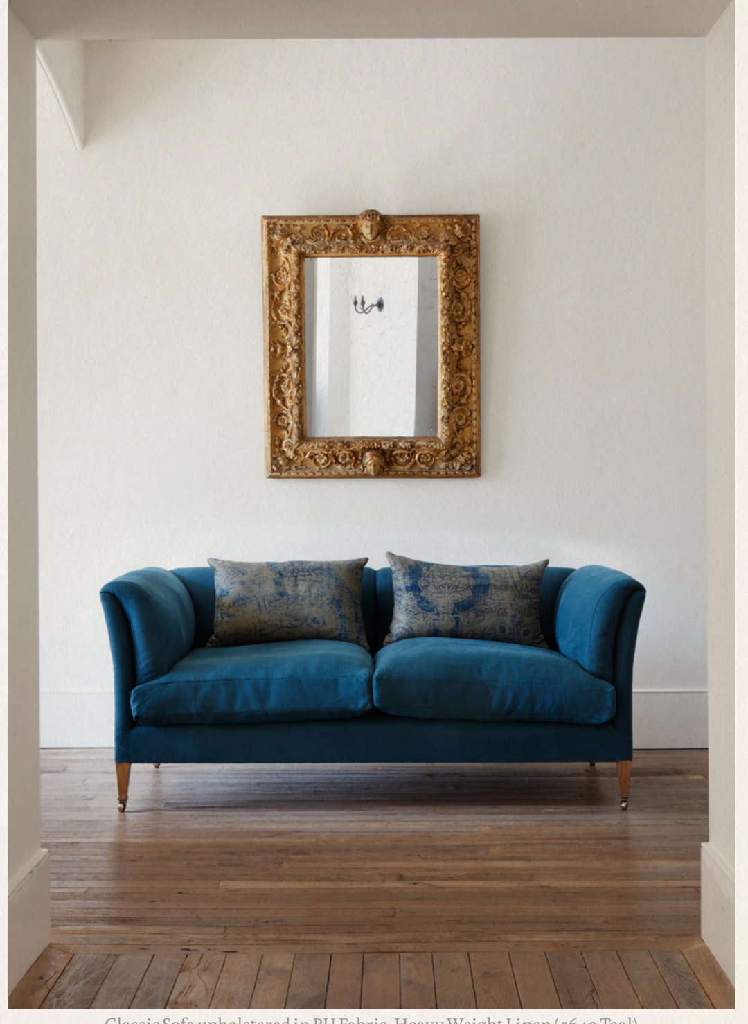
Classic Sofa upholstered in RU Fabric, Heavy Weight Linen (5640 Teal)

X Large 23m of fabric required W300cm×H80cm×D120cm £10,200