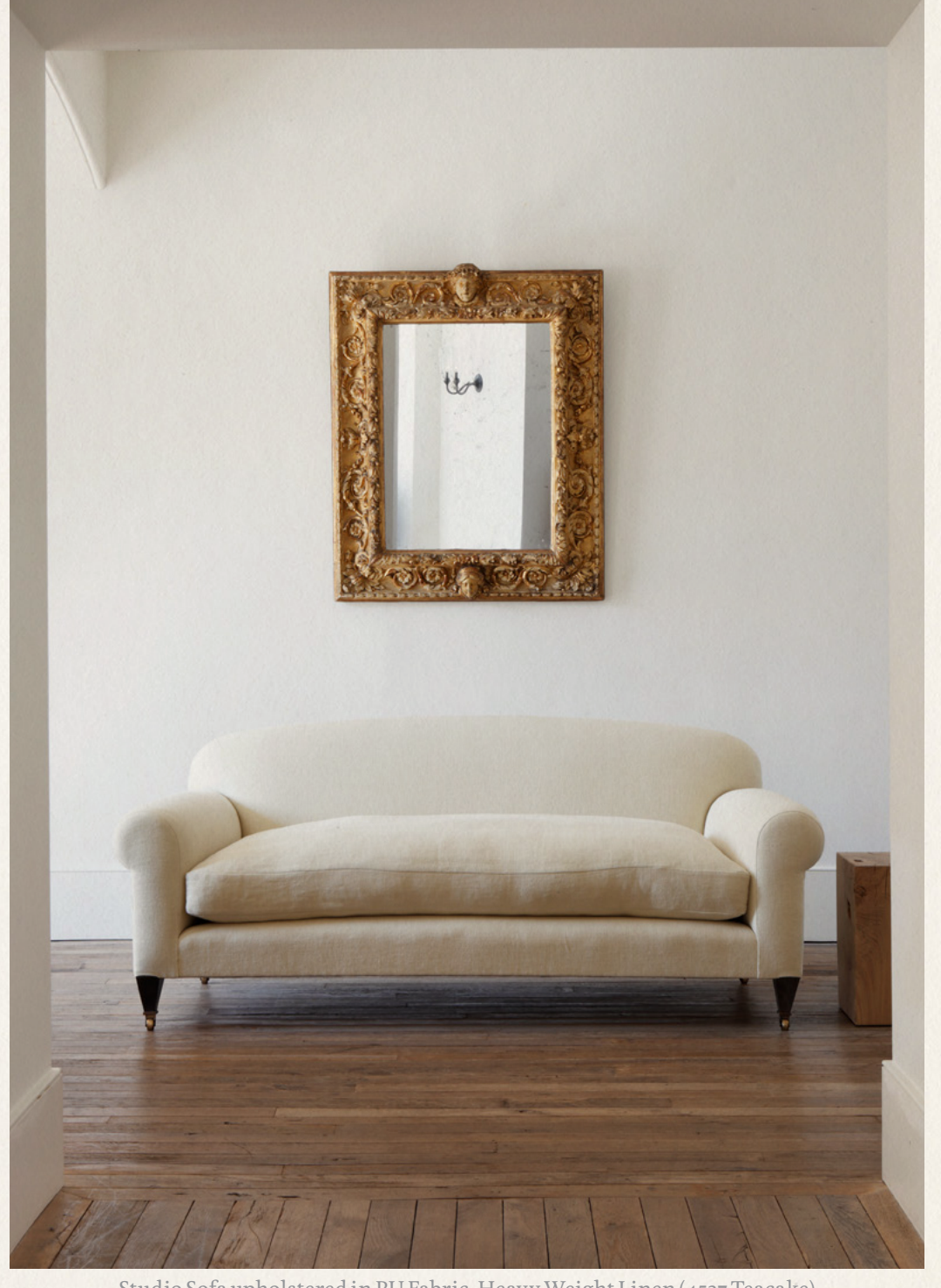
Studio Sofa upholstered in RU Fabric, Heavy Weight Linen (4537 Teacake)

X Large 20m of fabric required W300cm×H85cm×D110cm £10,200