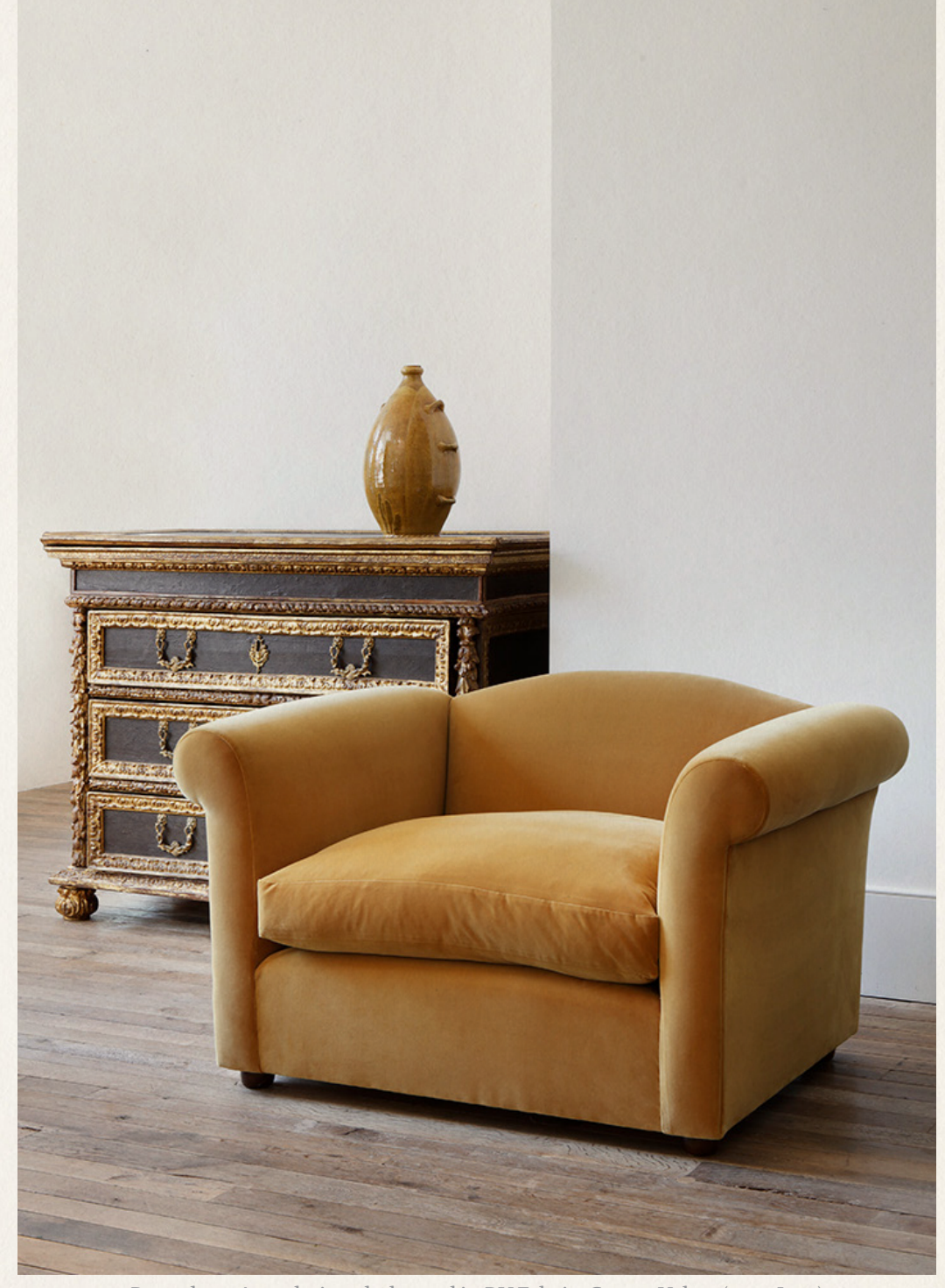
Petersham Armchair upholstered in RU Fabric, Cotton Velvet (4192 Java)

12m of fabric required W132cm×H77cm×D98cm £4,560